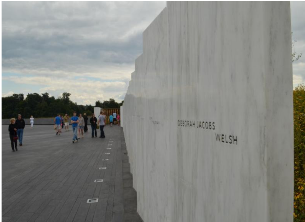
(Continued on page 2)

A change for the 2015 reunion is that the memorial service and scheduled activities will