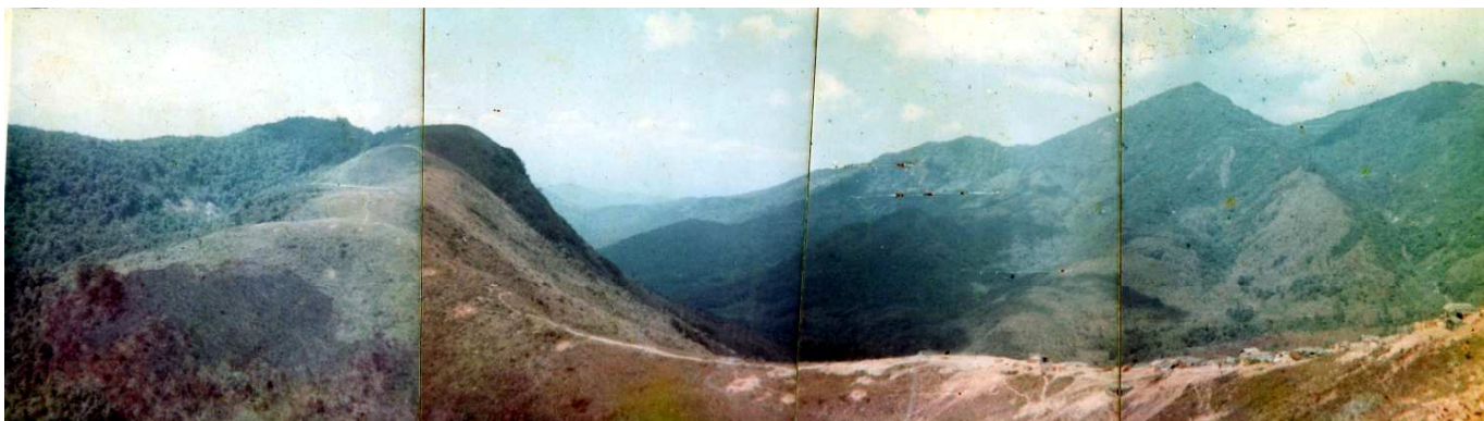
Four photographs make up this panoramic view of LZ Cork while it was manned by Delta Company.