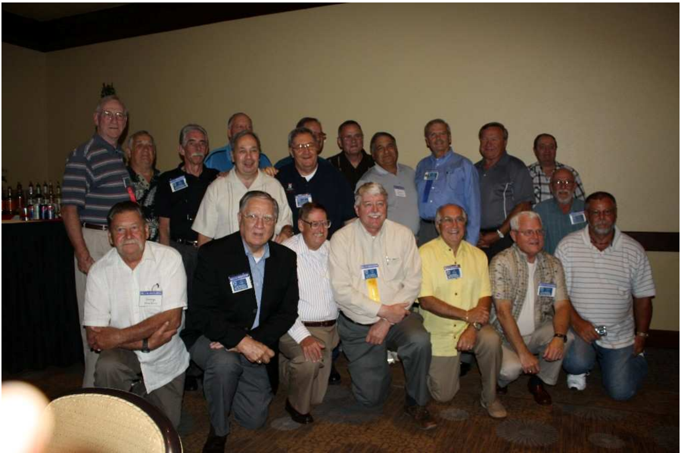
Vietnam Veterans from Bravo Company during the reunion in Tampa, FL.

The following pictures have recently been posted in the Hill 4-11 Photo Gallery :